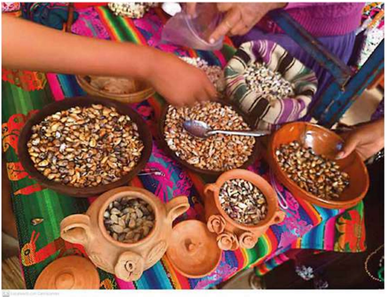
J j Jank'a