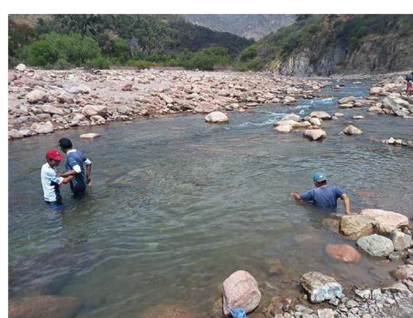
Y y Yaku