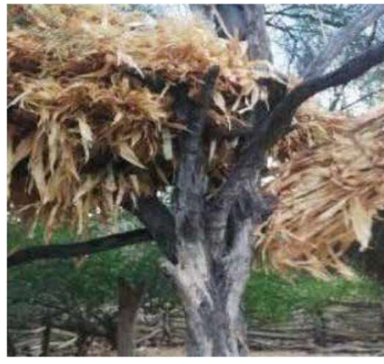
CHH chh Chhalla