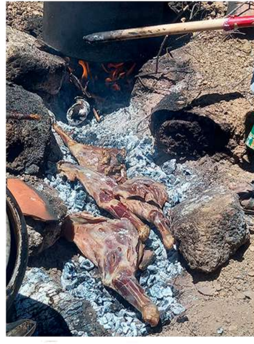
K k Kanka