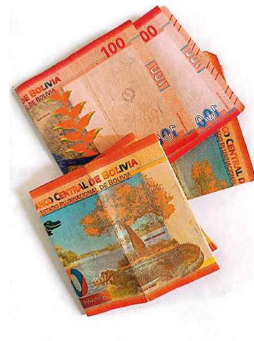
Q q Qullqi