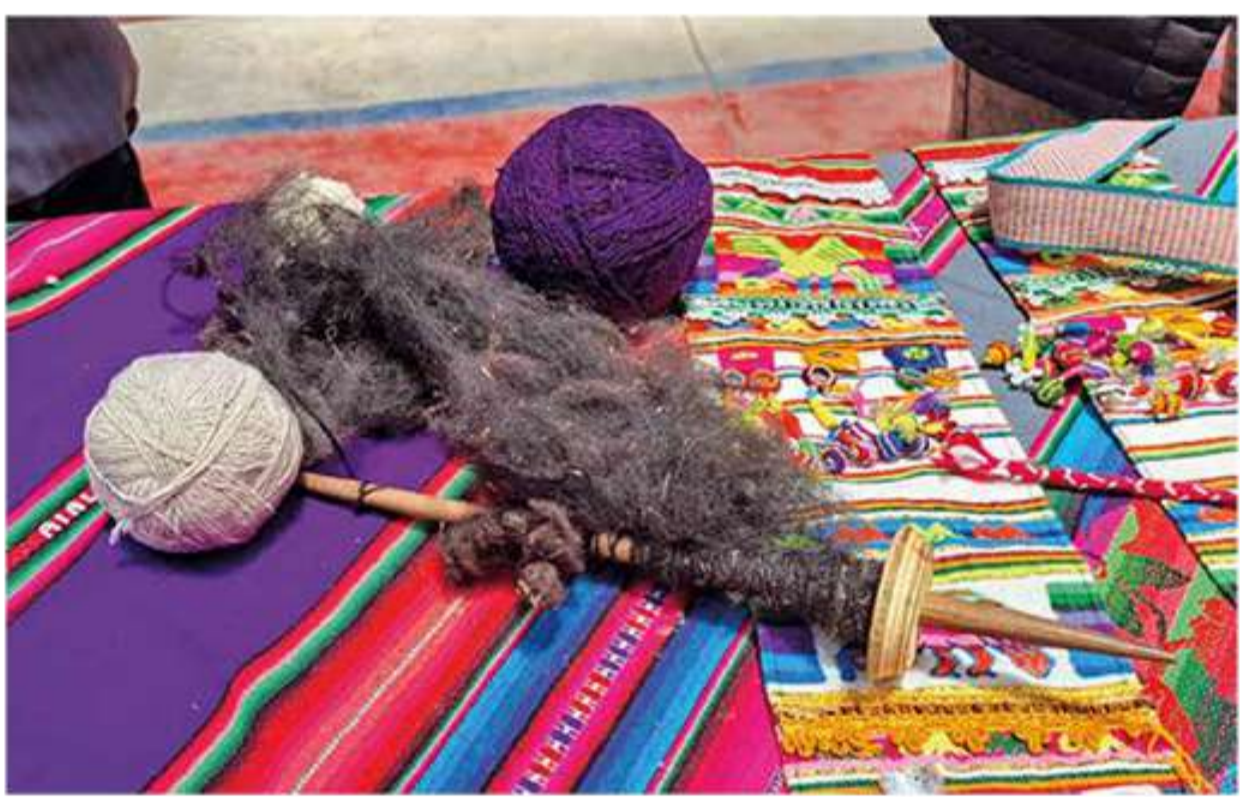
PH ph Phuchka