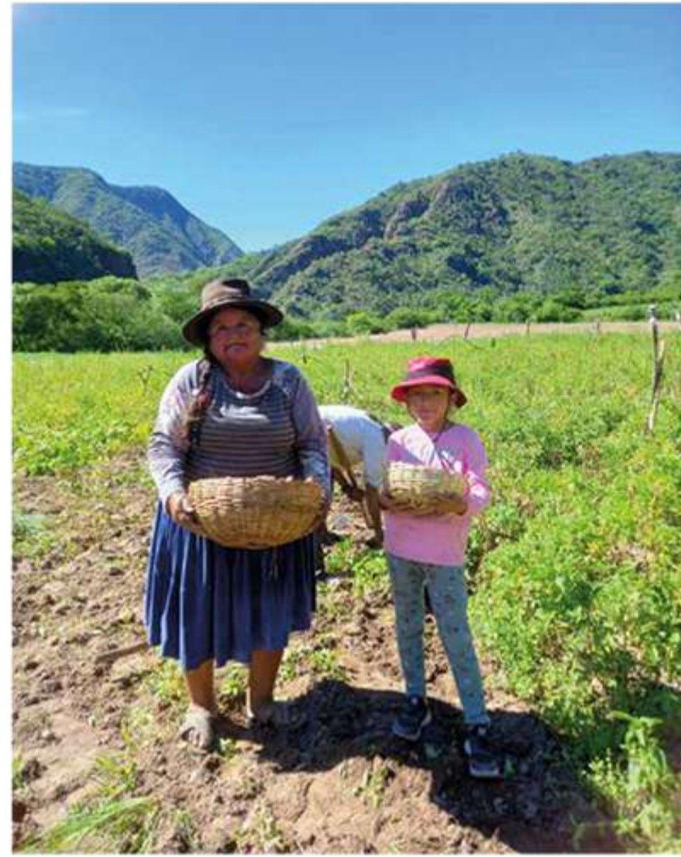
M m Mama