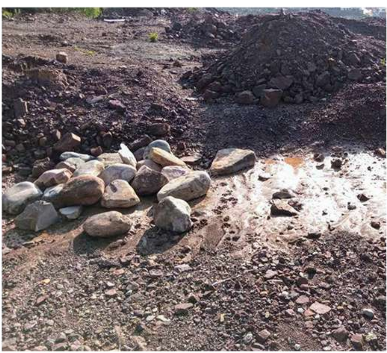
R r Rumi