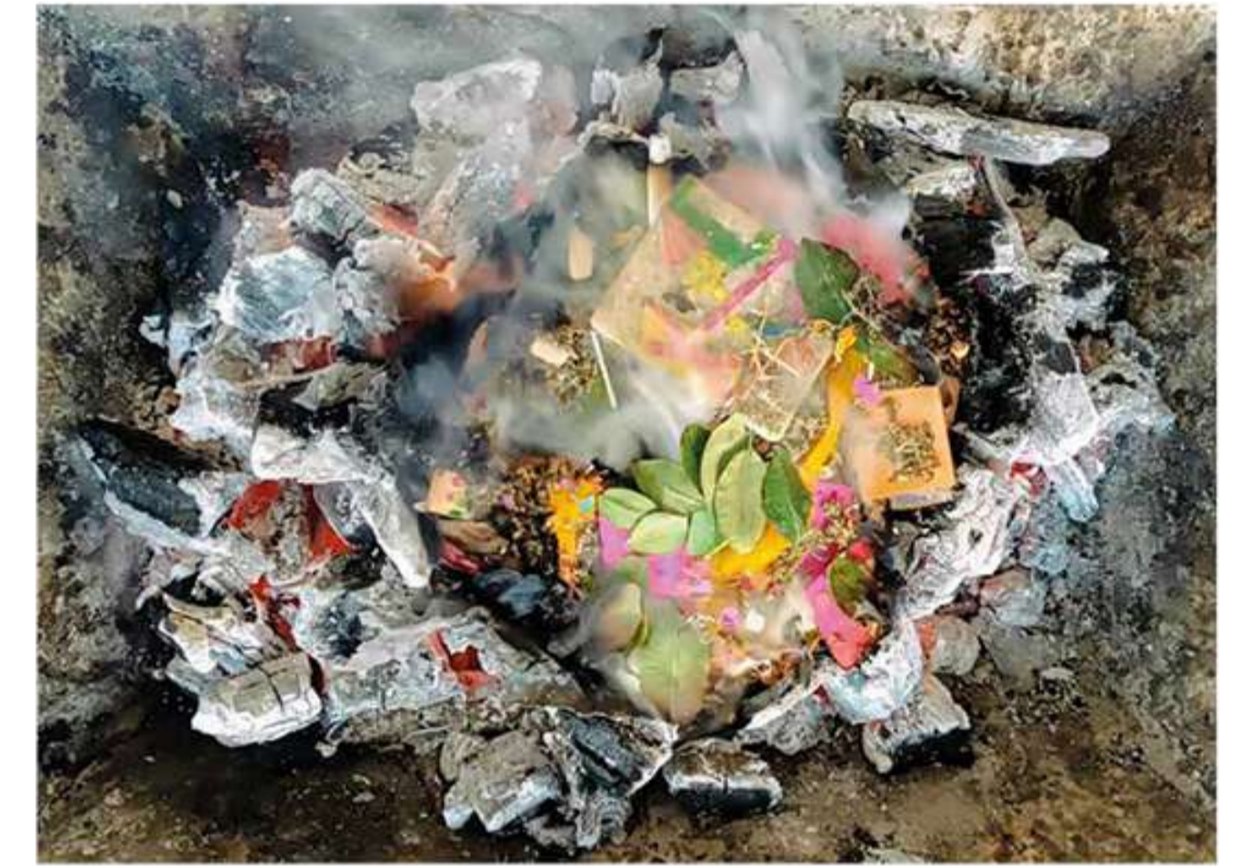
Q' q' Q'uwa