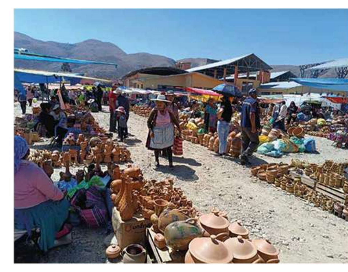
QH qh Qhatu