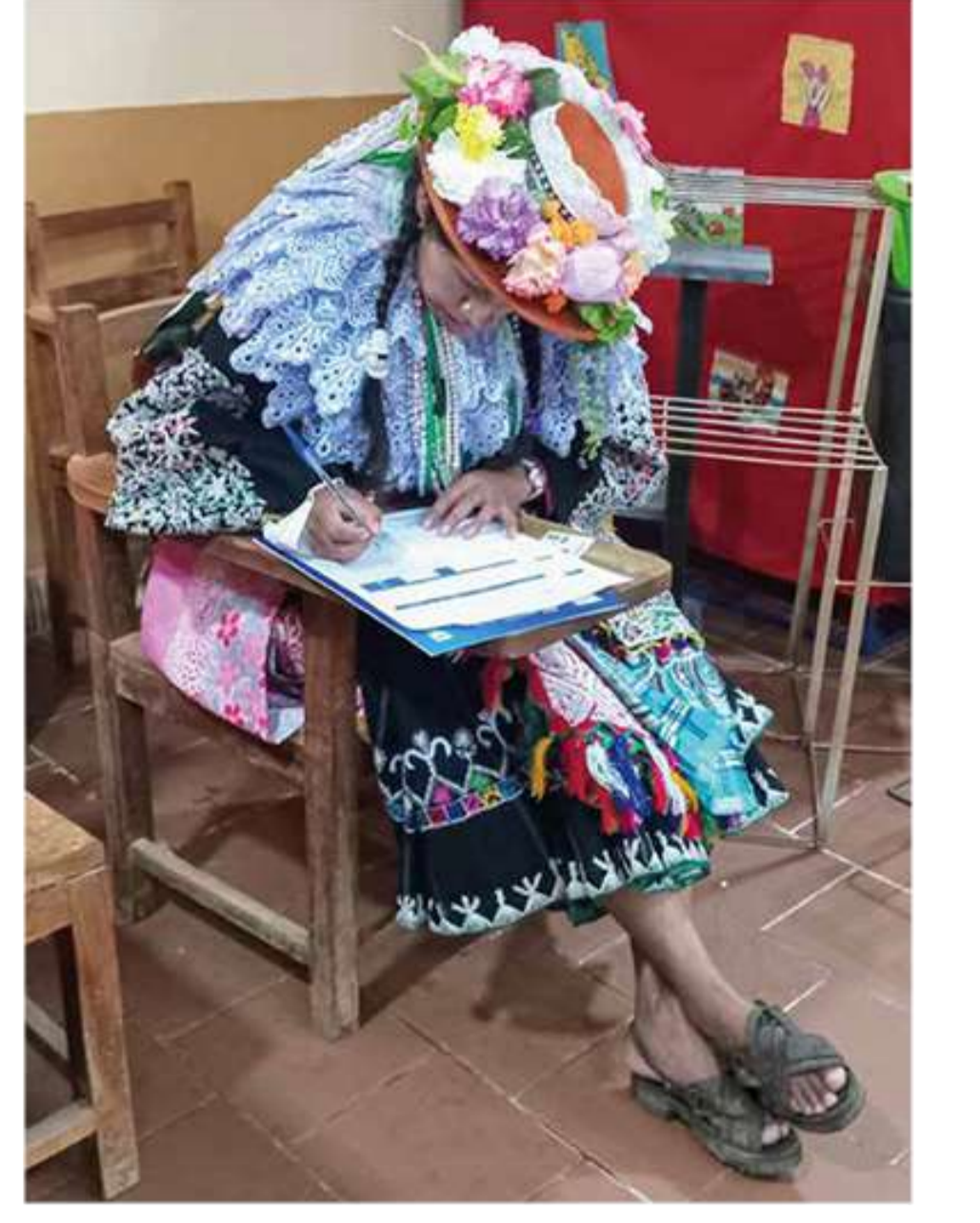
l i lmilla