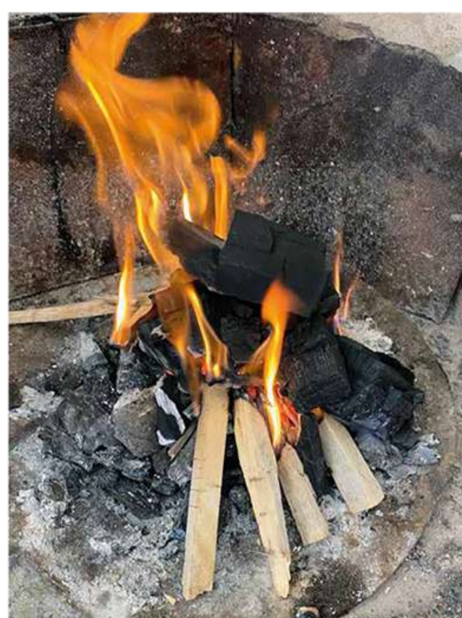
N n Nina