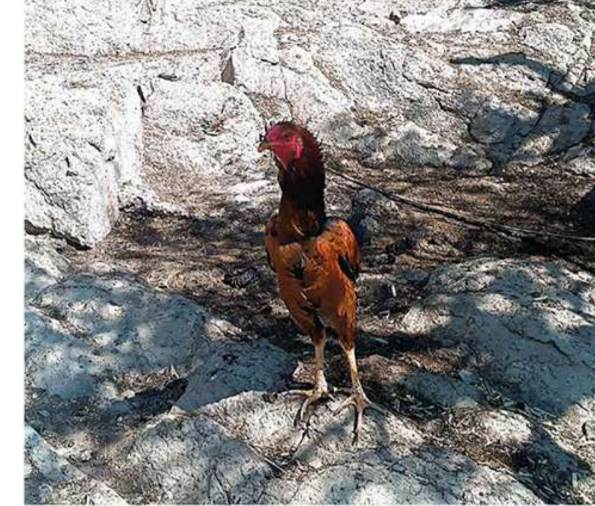
K' k' K'anca