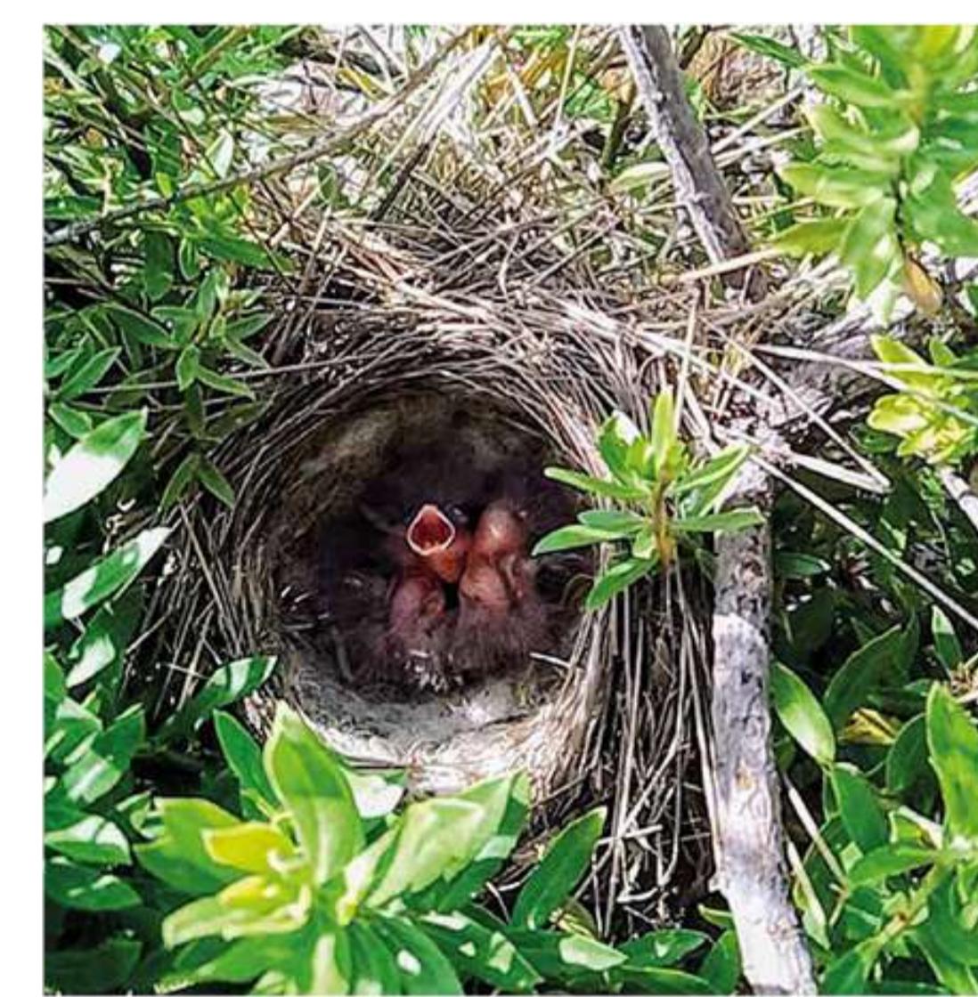
TH th Thapa