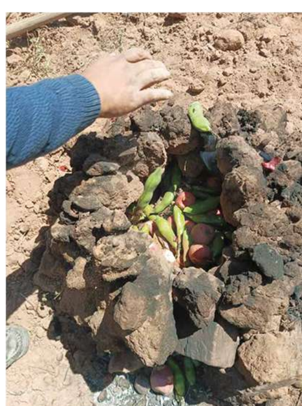
W w Wathiya