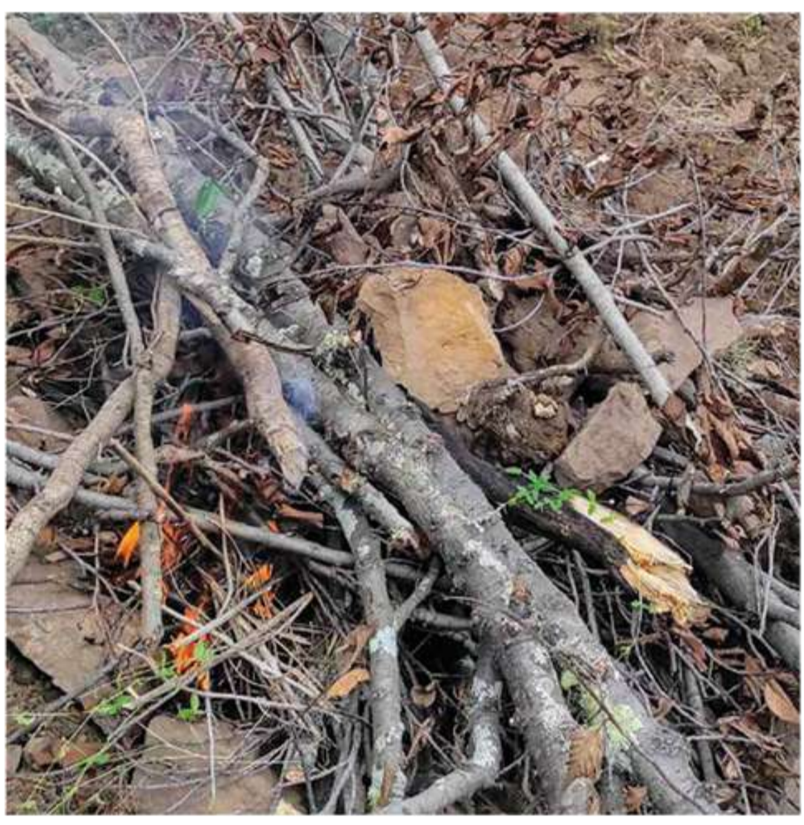
Ll ll Llamt'a