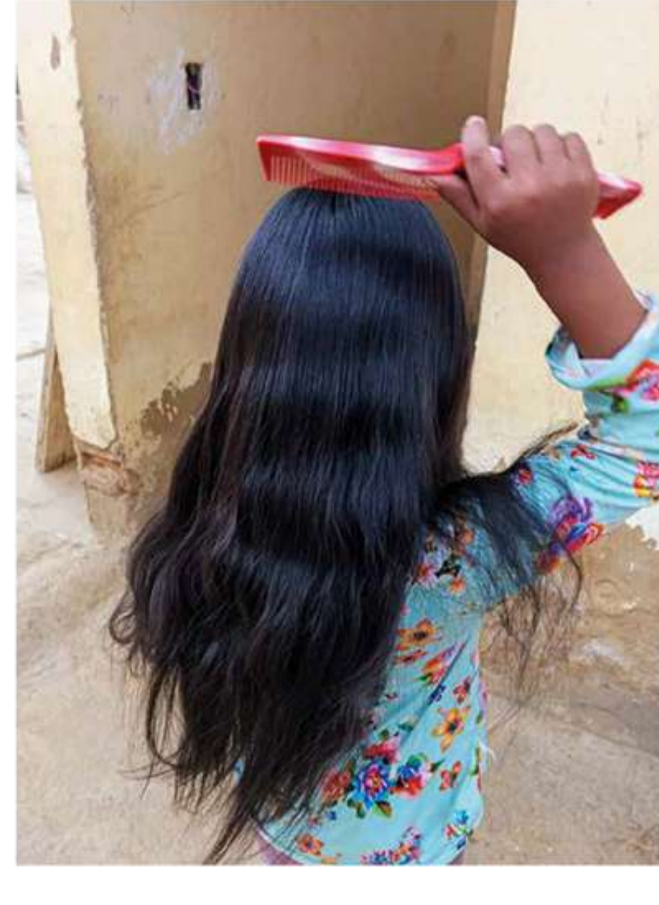
CH ch Chukcha