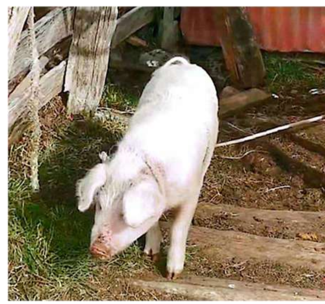
KH kh Khuchi