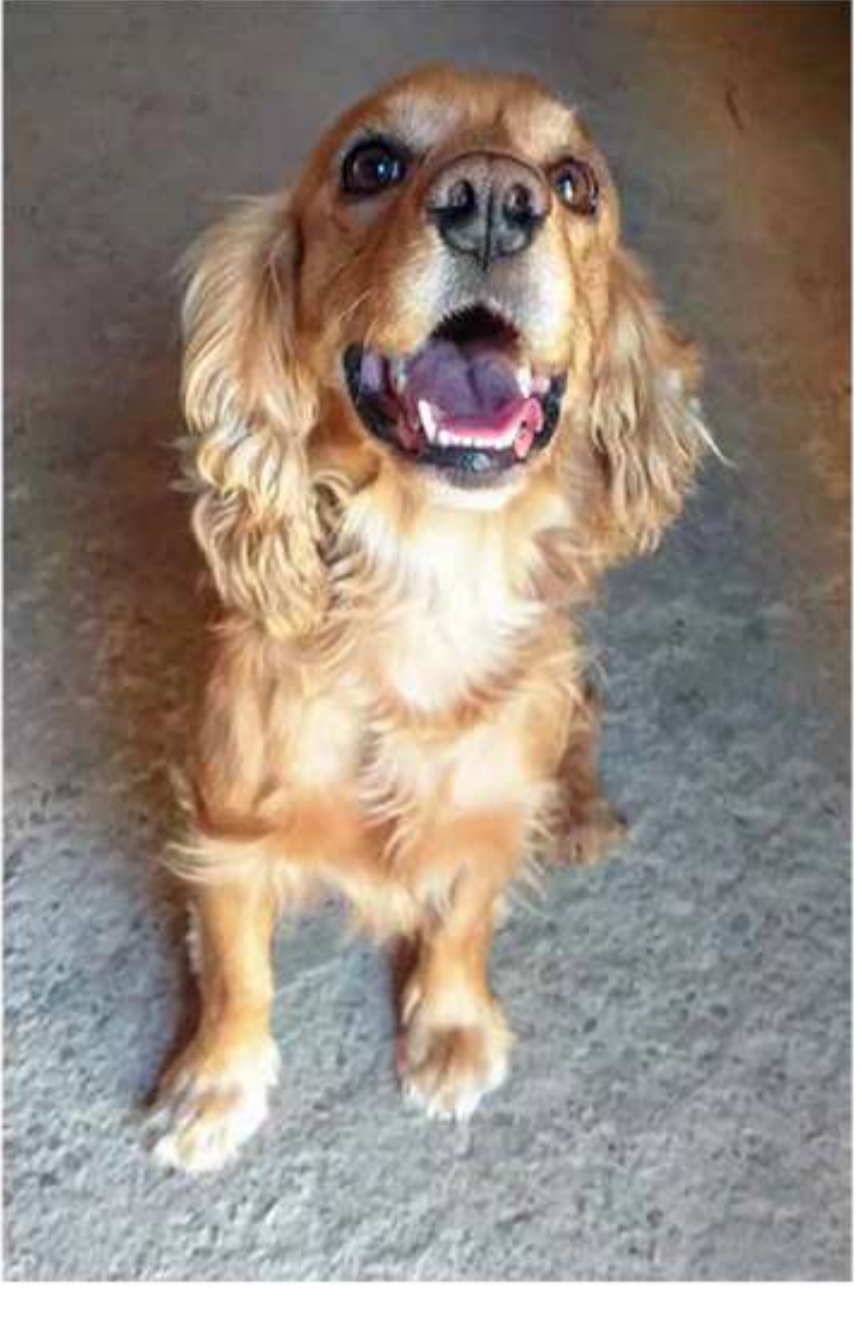
A a Allqu