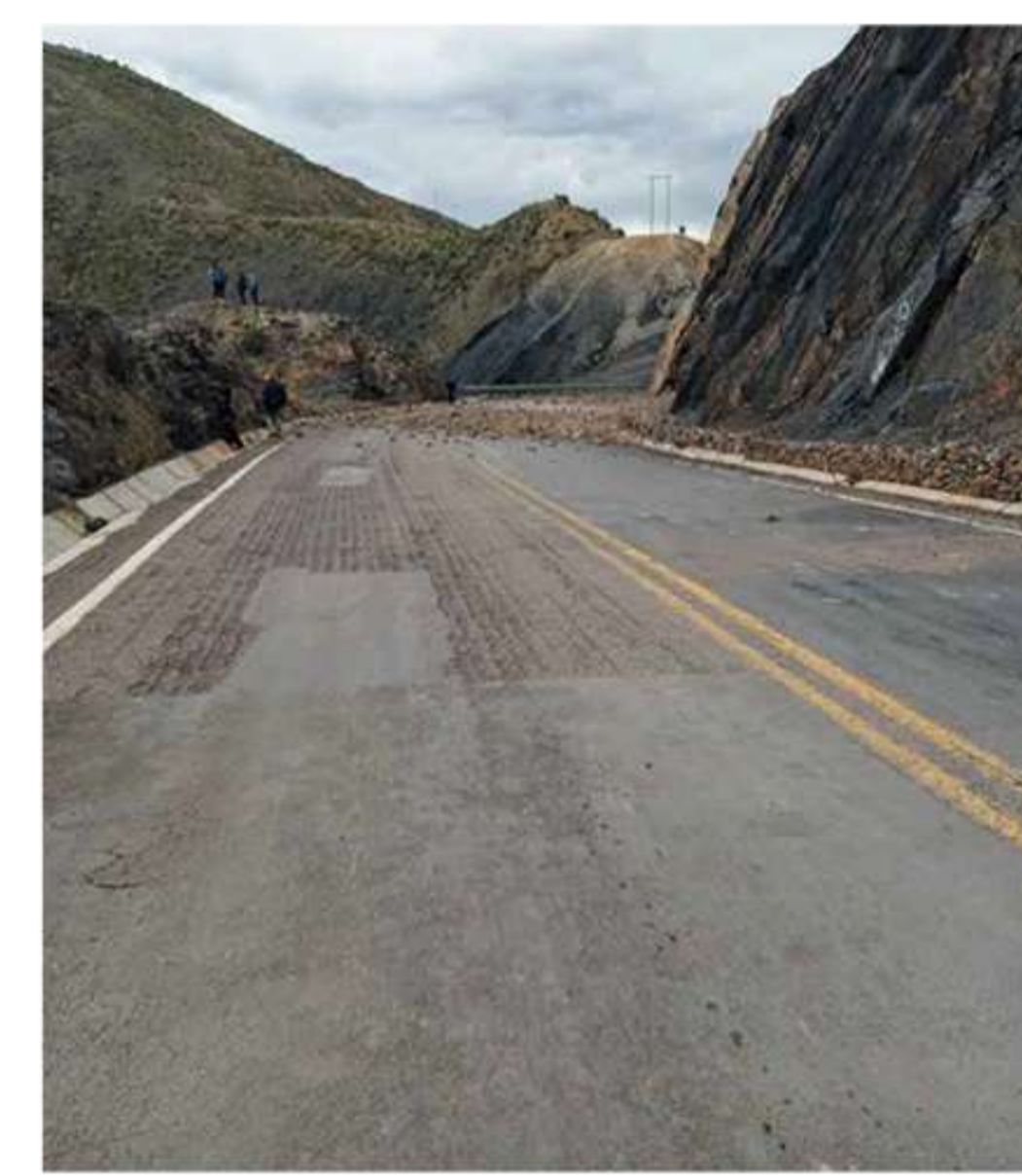
Ñ ñ Ñan