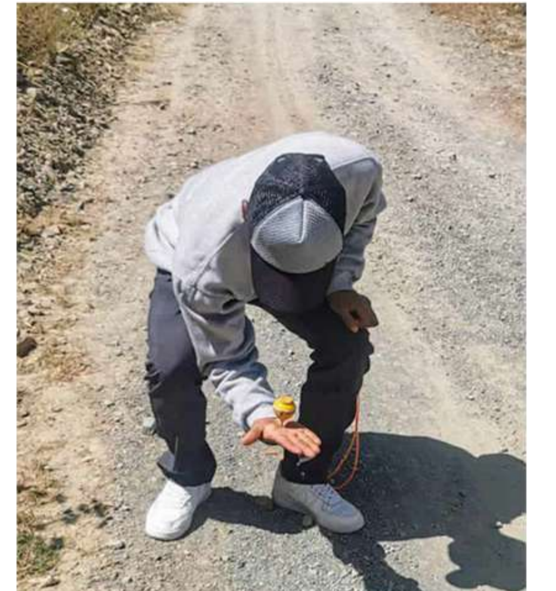
P p Pukllay