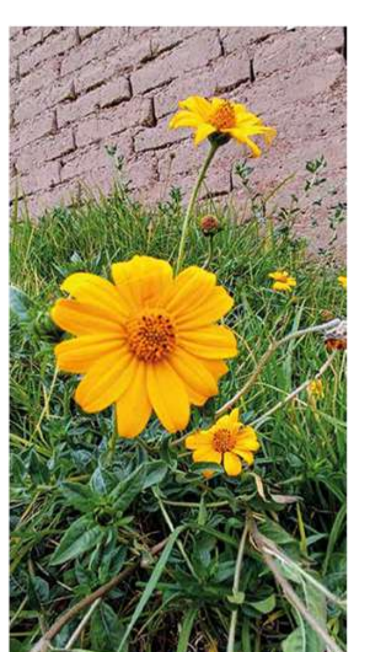
T' t' T'ika