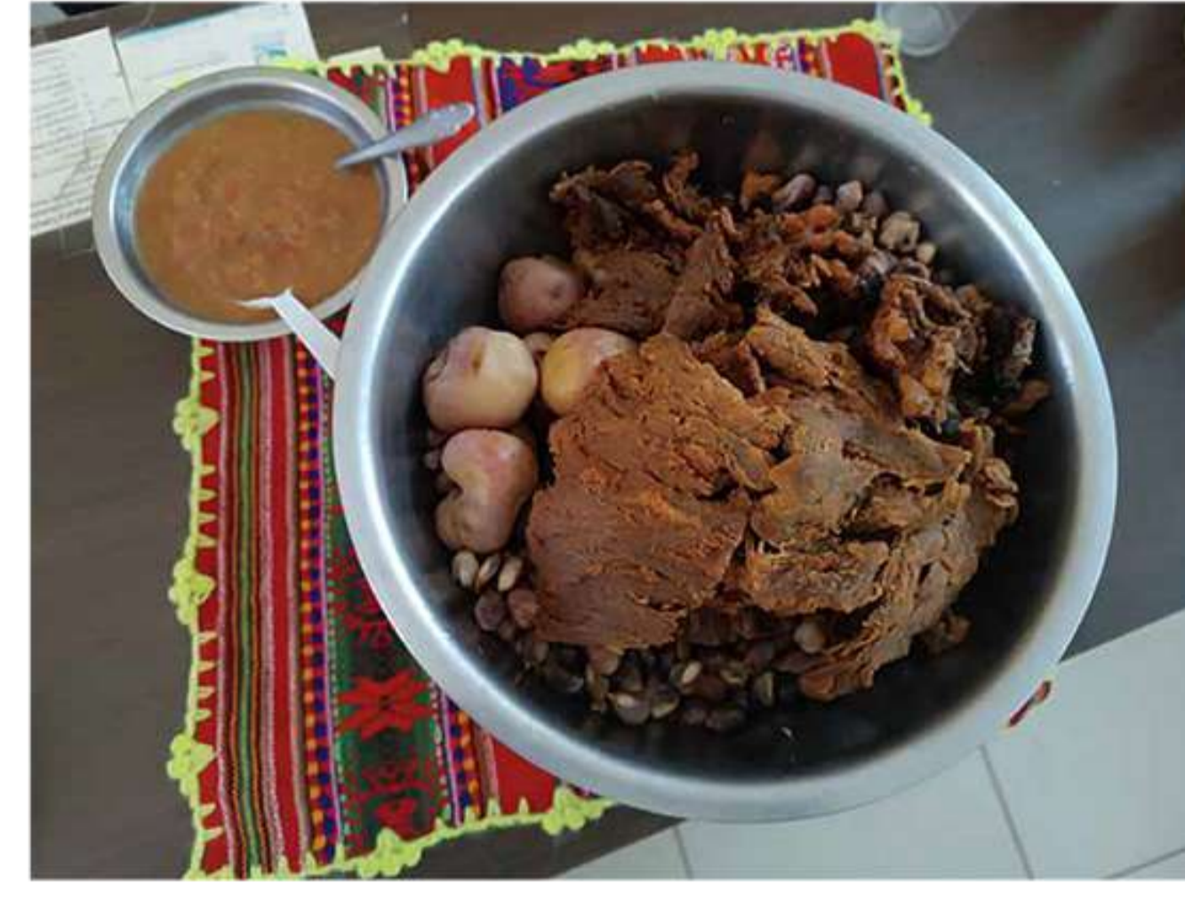
CH' ch' Ch'arki