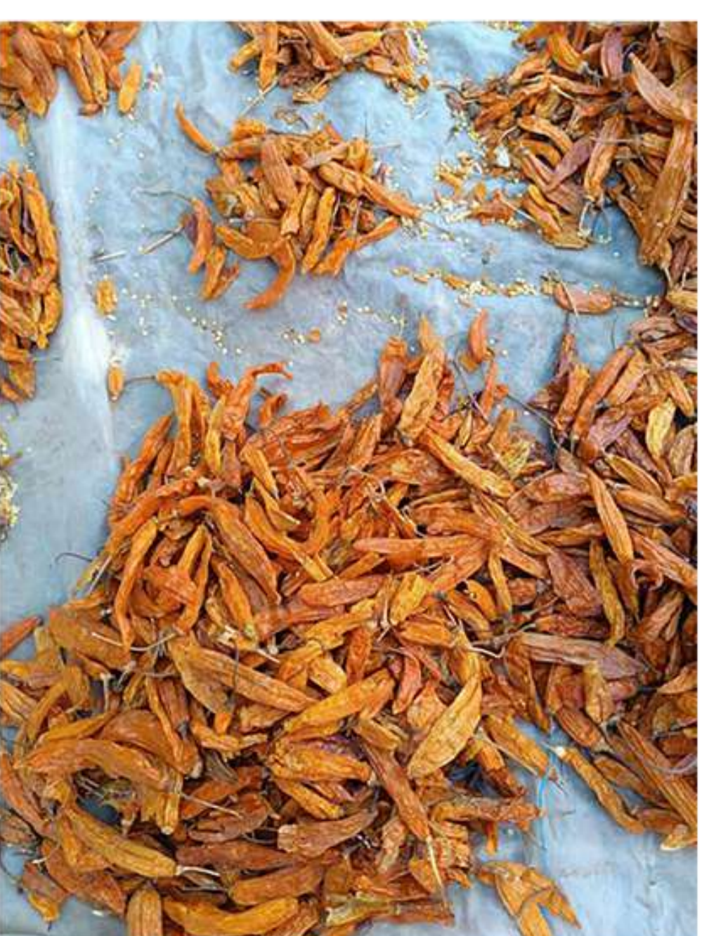
U u Uchu