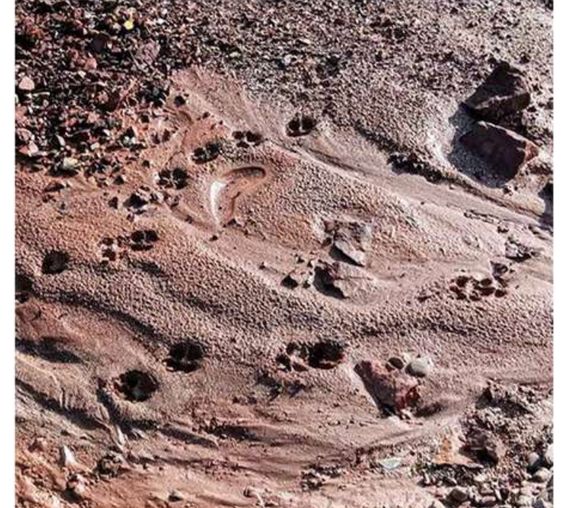
L l Lama